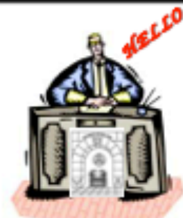
Most Illustrious One

The Peninsular No.95 of Everett Informer